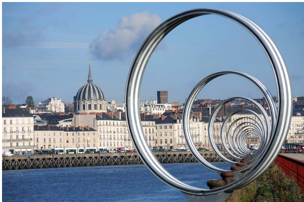
Les Anneaux de Buren

10:30-11:00: Coffee-tea break and EDACwowe “Data Stop and Shop”