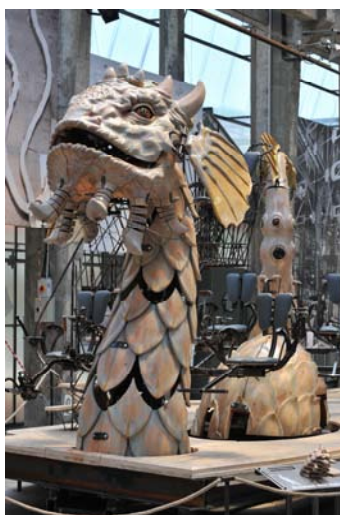
Machines de l’île, Galerie des Machines, Le Serpent des Mers, © Nautilus Nantes

19:00: Visit of the Machines de l’île and dinner in the Galery of the Machines