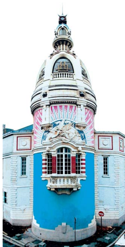
Espace LU, © Vincent Jacques

19:30: Dinner at the LU restaurant – dinner meeting of the EC with the AC