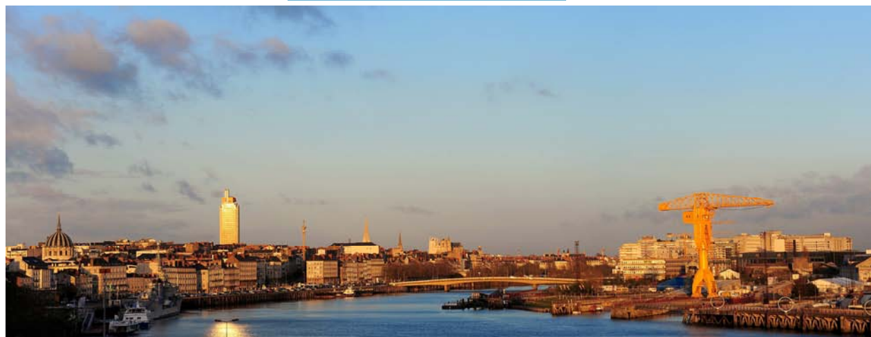
Vue générale de Nantes et du port

19:00: Visit and dinner in the Musée des Beaux Arts (please check the map page 25)