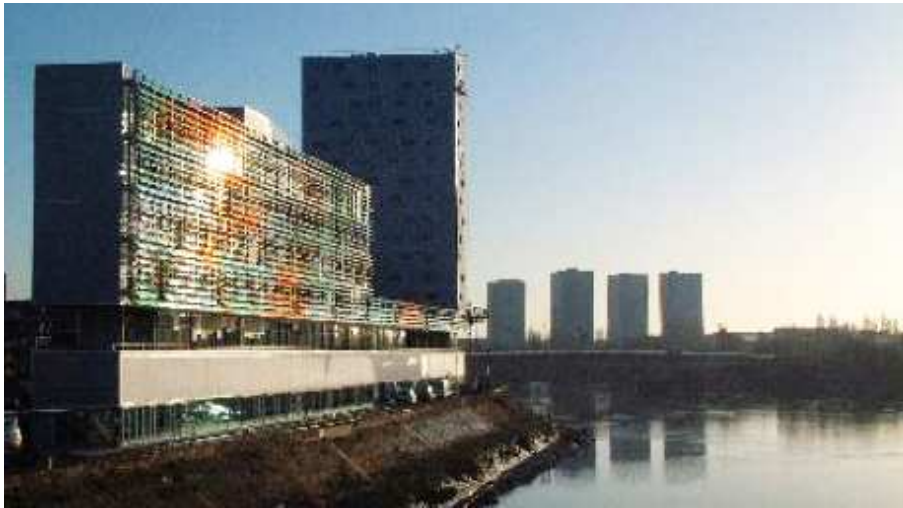
Maison des sciences de l'homme Ange-Guépin

Meeting rooms will be available on demand in the Maison des sciences de l'homme Ange-Guépin