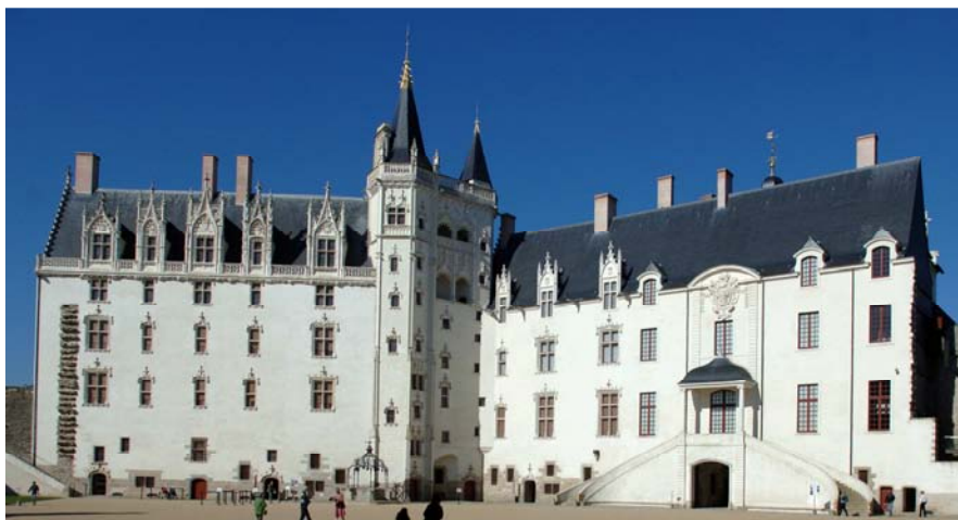
Château des Ducs de Bretagne

15:00-15:30: Coffee-tea break and EDACwowe “Data Stop and Shop”