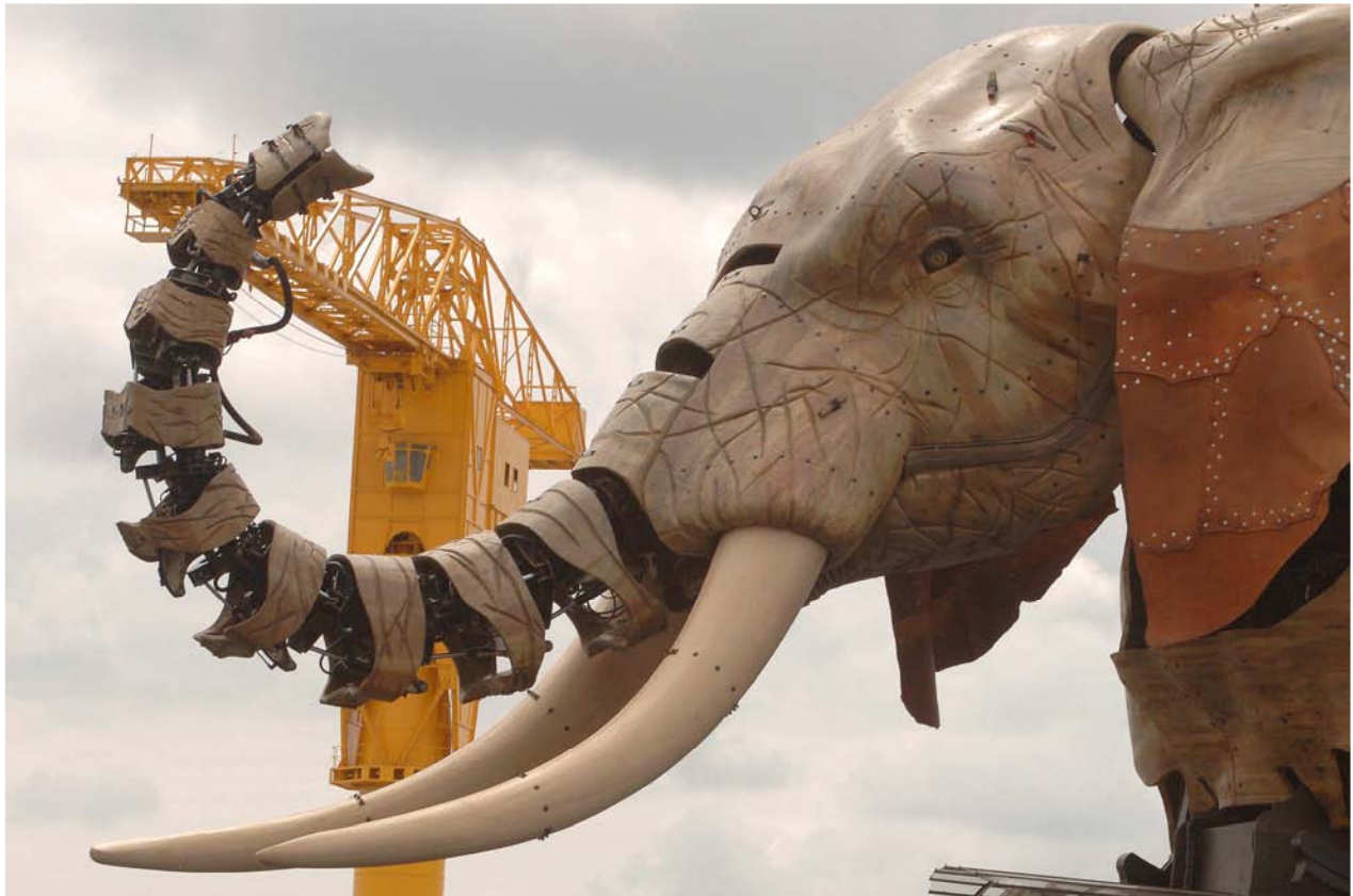
Machines de l'île, Le Grand Éléphant devant la Grue jaune

Organised by the Maison des sciences de l'homme Ange-Guépin (MSHG) , Nantes, France, and the Centre for European Studies (CEE) at Sciences-Po Paris